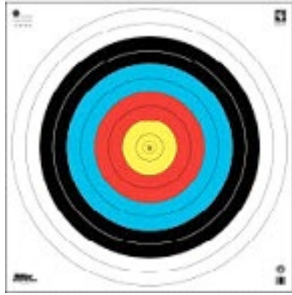
60 cm used in unsighted & sighted divisions